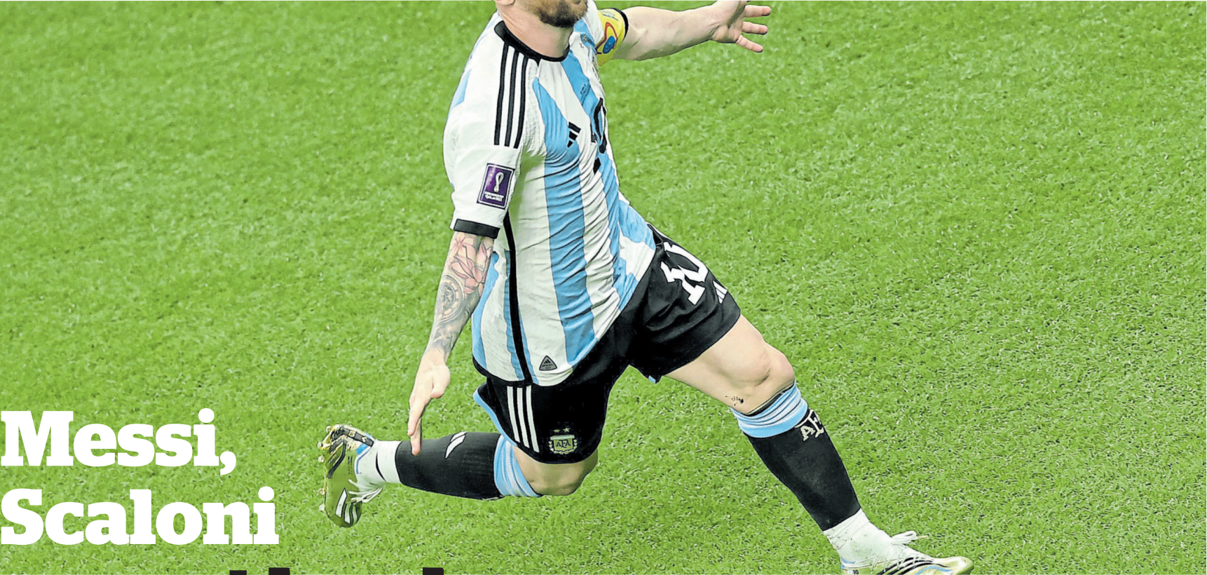
Lionel Messi of Argentina celebrates after scoring the team's first goal during in the Round of 16 match against Australia at Ahmad Bin Ali Stadium in Doha on Saturday. Argentina won 2-1.